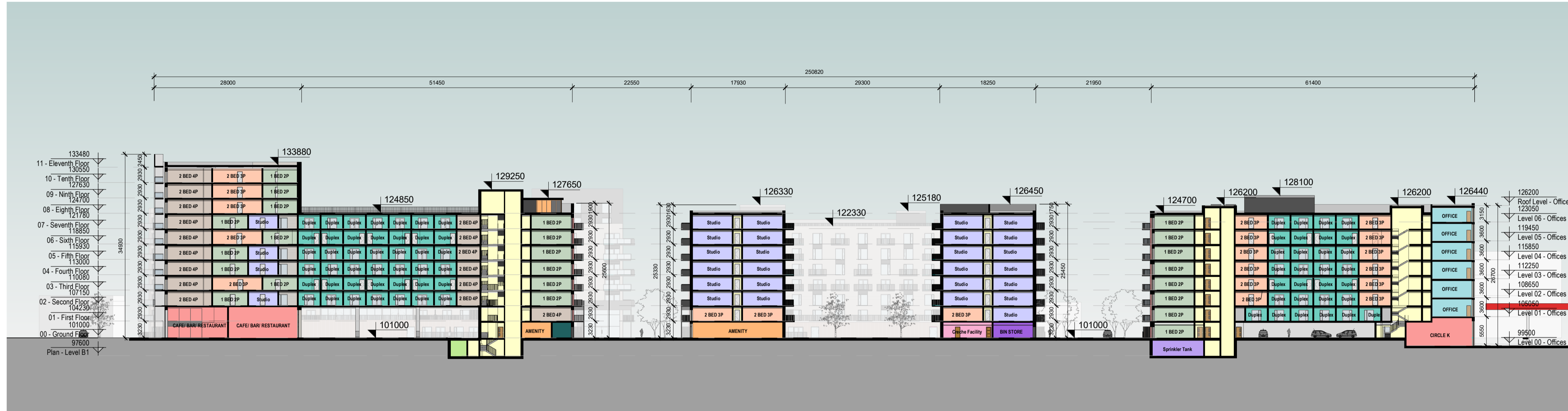
A Contextual Section A